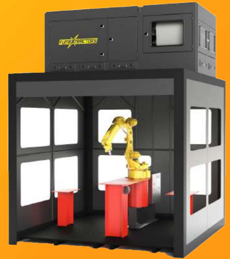
Shown with robotic welder & enclosure